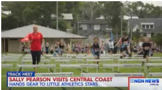
TRACK MEET SALLY PEARSON VISITS CENTRAL COAST HANDS GEAR TO LITTLE ATHLETICS STARS